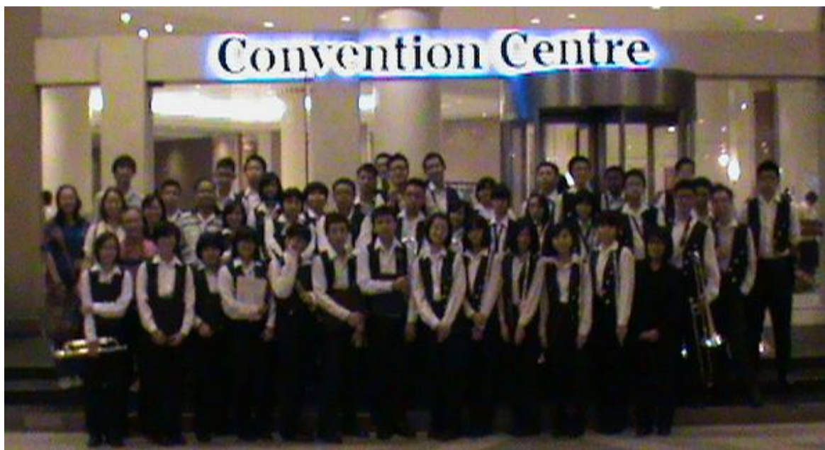
Photo 6 : Participation in communal functions - Chinese New Year , 22 February 2013