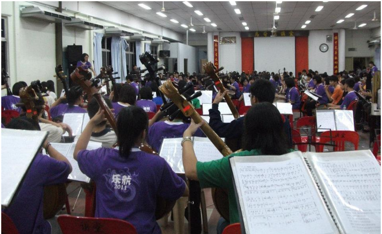
Photo 8 : Participated in the school event, String Philharmonic, 23 August 2012